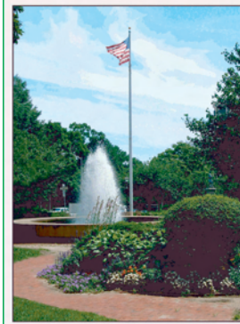
Committed volunteers partnering with our supporters and donors to bring beauty to our city for over 45 years

Hear ye, hear ye, you can wander throughout our gardens by following the map WPBF recently published of our nearly 60 gardens planted throughout the city. Our new brochure includes a fold-out 17- by 11-inch-map marking the locations of our gardens. The brochure, which also explains WPBF's mission, our programs, activities and accomplishments, and a list of ways you can participate, can be found at the White Plains Public Library, White Plains Department of Recreation and Parks office on Gedney Way, local real estate offices and nurseries. Pick up a