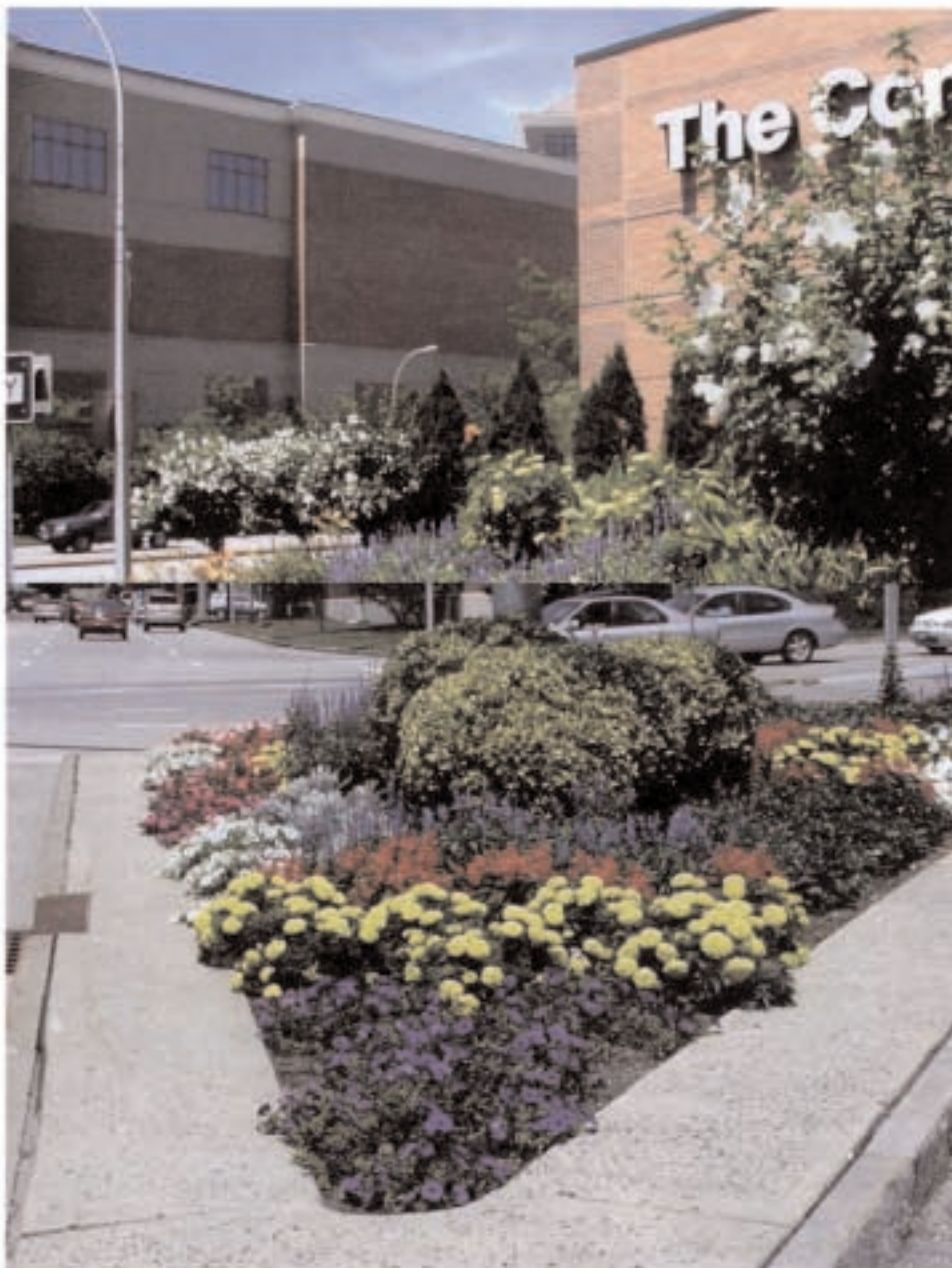
Top: Gardens at the Container Store. Adopt-a-Park Major Sponsor The Container Store. Below: Triangle Garden. Adopt-a-Park Major Sponsor: Crowne Plaza.