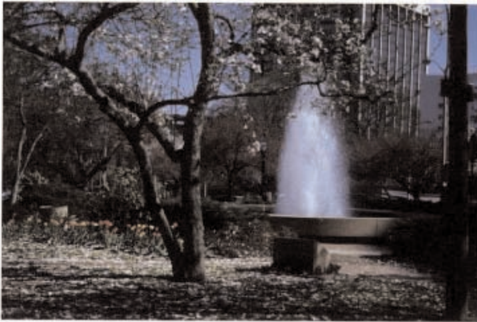
Triantafyllu Fountain in Tibbits Park at Main Street & North Broadway. Adopt-a-Park Major Sponsor: the George Sakier Foundation.