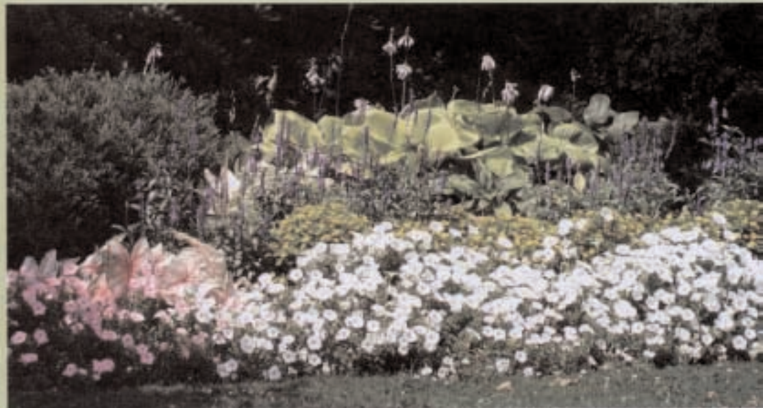
Hosta Garden at Maple Avenue and South Broadway. Adopt-a-Park Benefactors: New York-Presbyterian Hospital and Ballard-Durand Funeral Home.