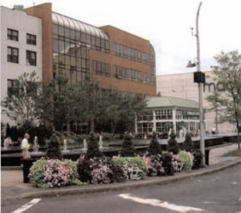
Planter Garden: Renaissance Park at Main Street and Mamaroneck Avenue. Platinum Sponsor: Cappelli Enterprises, Inc.