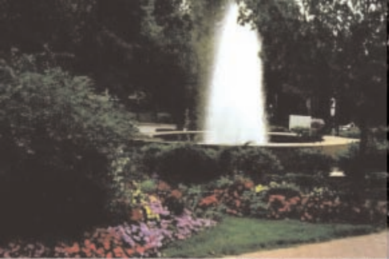
Triantafyllu Fountain Gardens, Main Street at North Broadway is sponsored by Platinum Adopt-a-Park Sponsor Ginsburg Development, LLC.