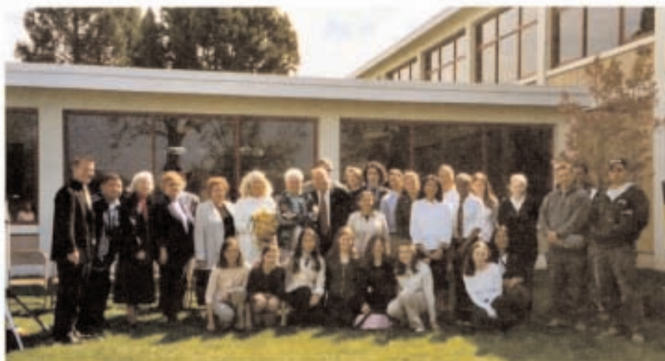
Arbor Day 2005 at White Plains High School: Dedicating a new Kwansan cherry tree.