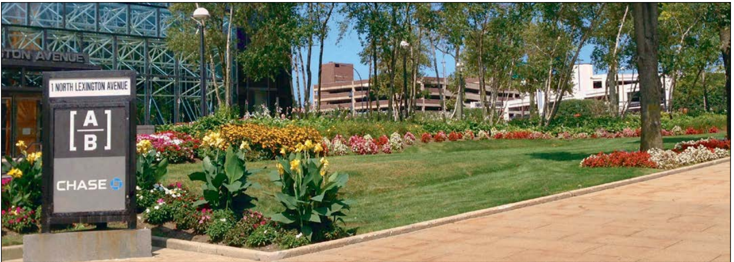
Gateway One at 1 N. Lexington

Bryant Gardens on Bryant Avenue - Playing to the Crowd. Chosen for its inviting colorful plantings at the entrance to the co-op complex.