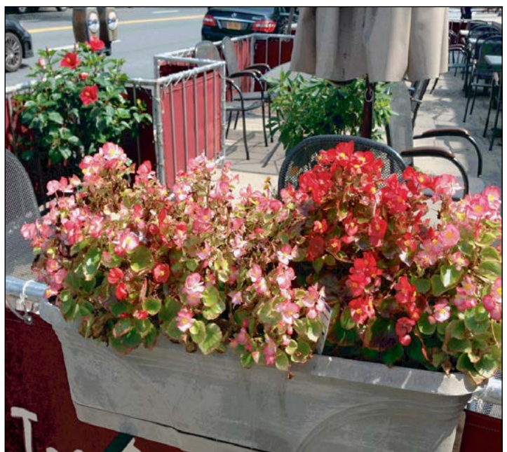
Tre Angelina at 478 Mamaroneck Ave.