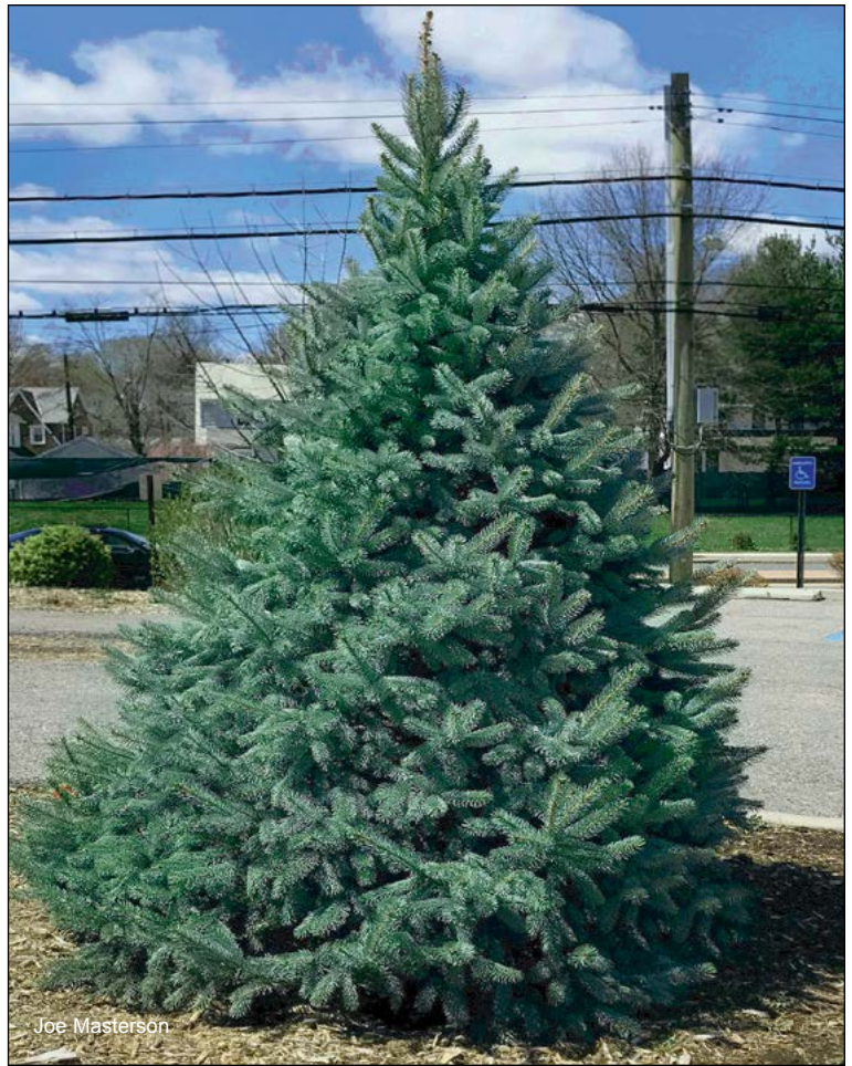
The blue spruce planted at Post Road School.