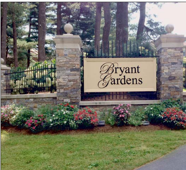
Bryant Gardens on Bryant Avenue